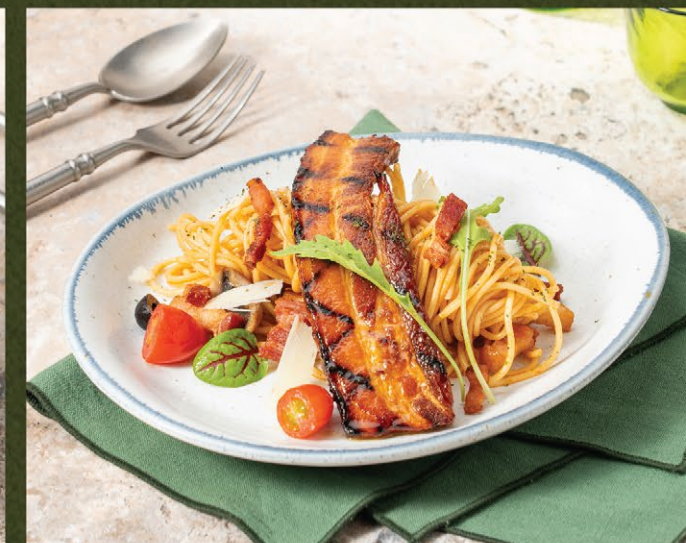
Spaghetti Aglio e Olio with Grilled Smoked Bacon and Herbs 350