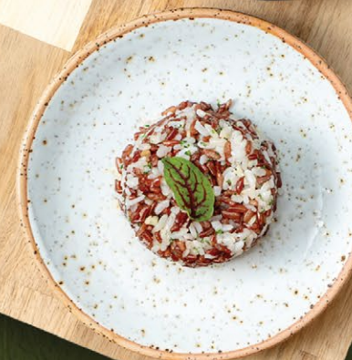
Lamb Curry With Almond and Garlic Fried Rice 650

All prices are subject to 10% service charge and 7% VAT in Thai Baht. The pictures are for advertising purpose.