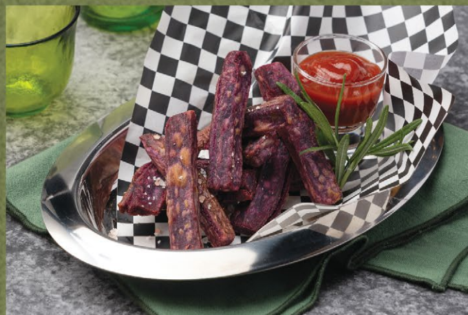
Bangrak Fries Thai Sweet Potato Fries 150