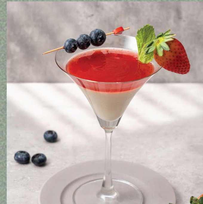
Berry Panna Cotta 🍷 220