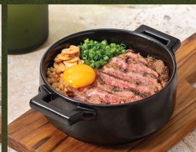
Smoky Beef Fat Fried Rice 🍷 Topped with Thai Wagyu Beef, Pickled Egg Yolk and Fried Garlic 550

All prices are subject to 10% service charge and 7% VAT in Thai Baht. The pictures are for advertising purpose.