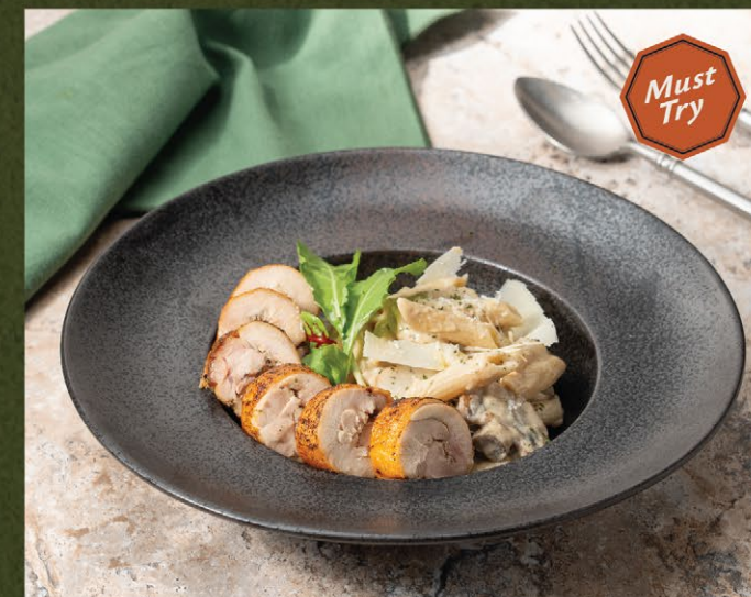
Penne in Truffle Cream Sauce 🍷 with Chicken Roulade 350