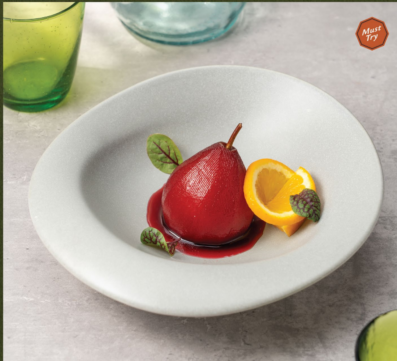
Poached Pear with Roselle and Orange Sauce 🍷 250