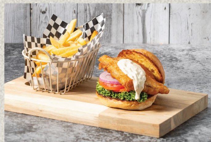
Sea Bass Burger with French Fries 400