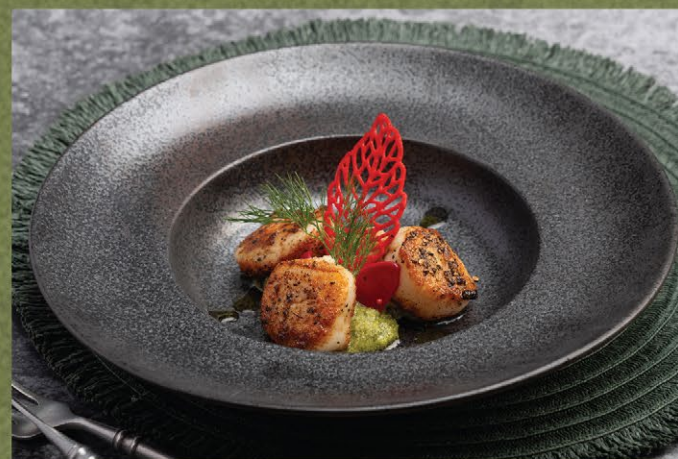
Seared Scallop with Thai Herb Pesto 690