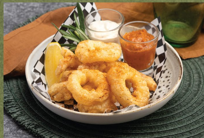
Fried Calamari Crispy Calamari with Tartar Sauce and Tomato Salsa 320