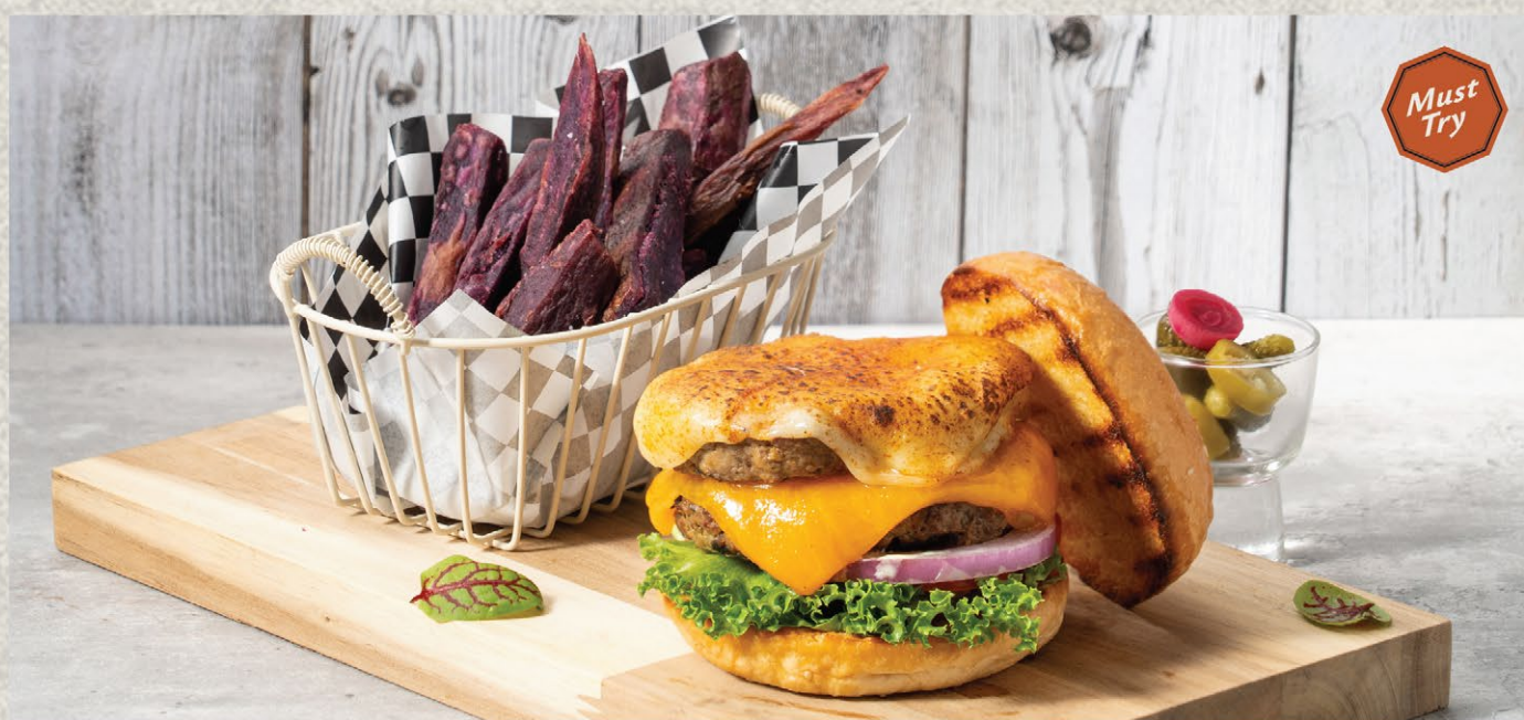
Bangrak Double Cheeseburger 🍷 Thai Wagyu Patties Layered with Cheese, Caramelized Onions and Bangrak Fries 450