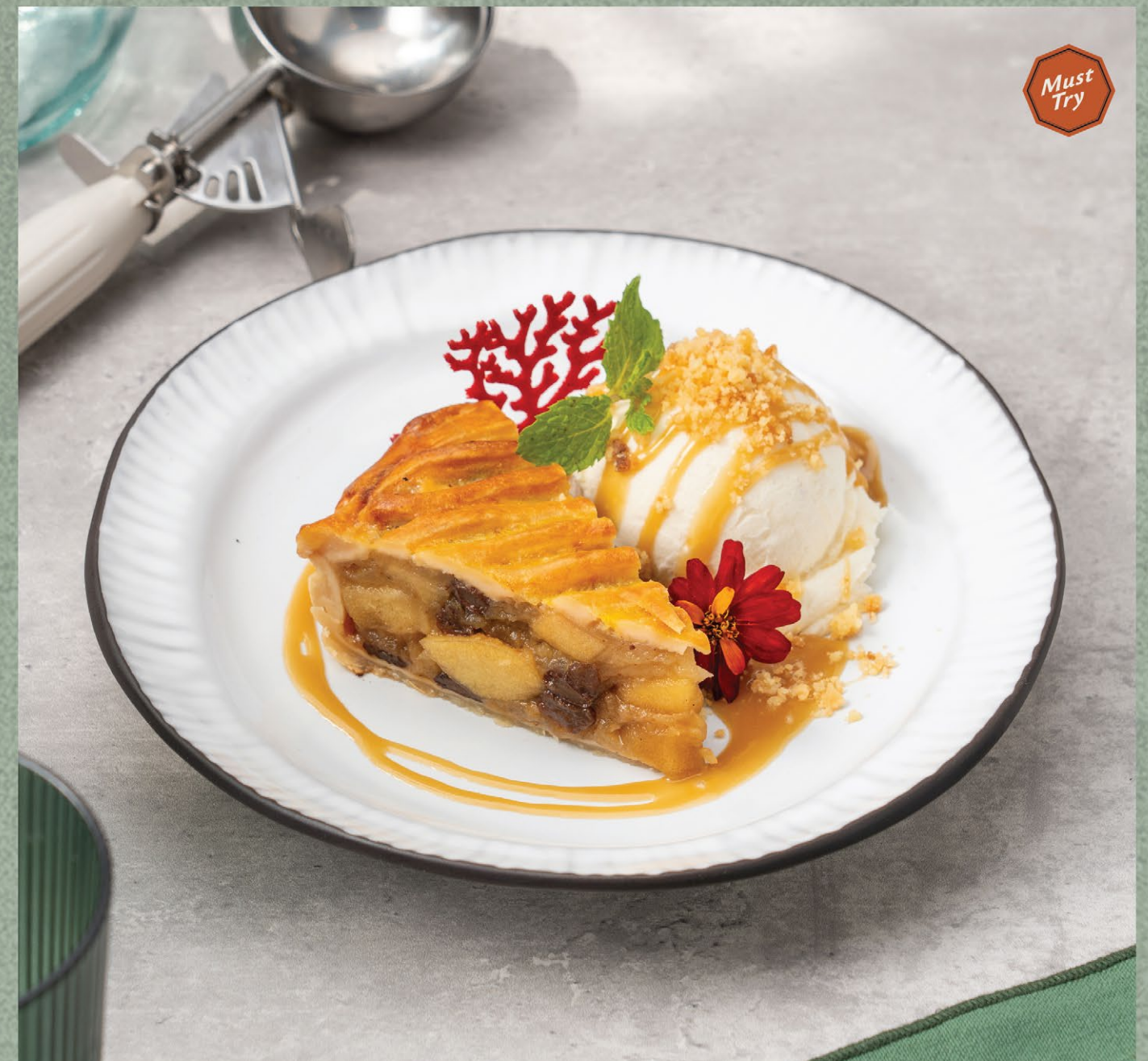
Apple Pie a la Mode 🍷 250

All prices are subject to 10% service charge and 7% VAT in Thai Baht. The pictures are for advertising purpose.