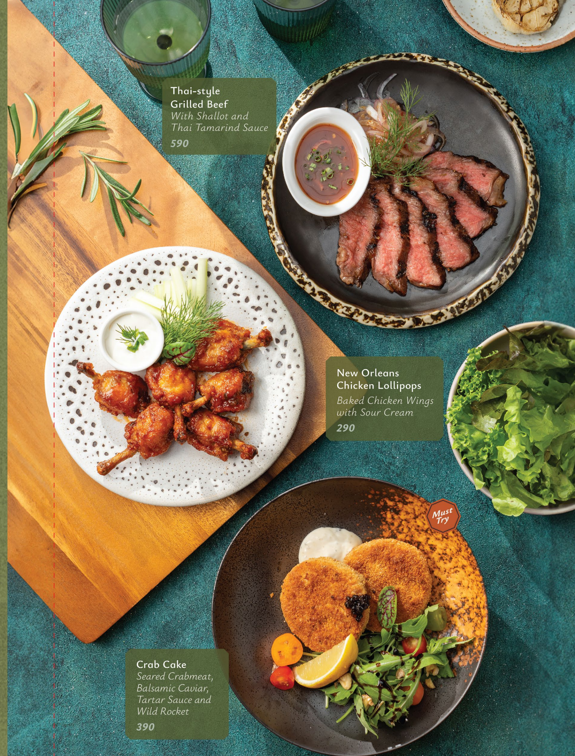
Thai-style Grilled Beef With Shallot and Thai Tamarind Sauce 590