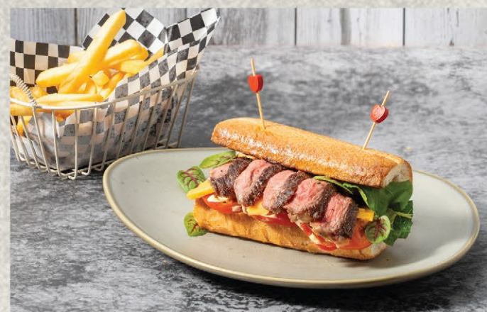
Grilled Beef Steak Sandwich 🍷 Thai Wagyu Beef, Mixed Greens, Garlic Mustard Sauce and French Fries 550

All prices are subject to 10% service charge and 7% VAT in Thai Baht. The pictures are for advertising purpose.