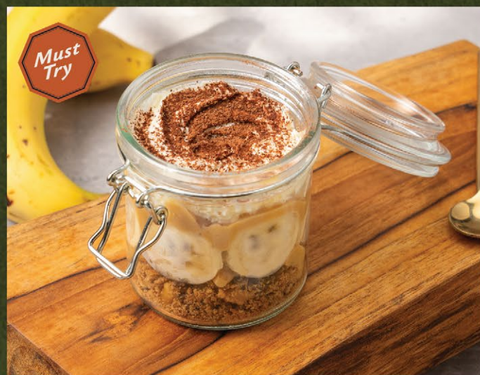
Banoffee Cream Pie 240