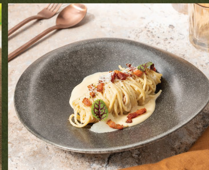
Spaghetti Carbonara with Pancetta and Cheesy Cream Sauce 350