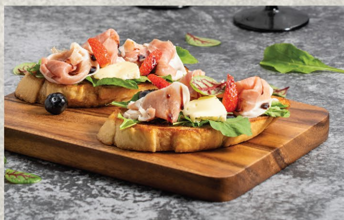
Parma Ham Bruschetta 🍷 Prosciutto, Cherry Tomato, Avocado and Wild Rocket 450