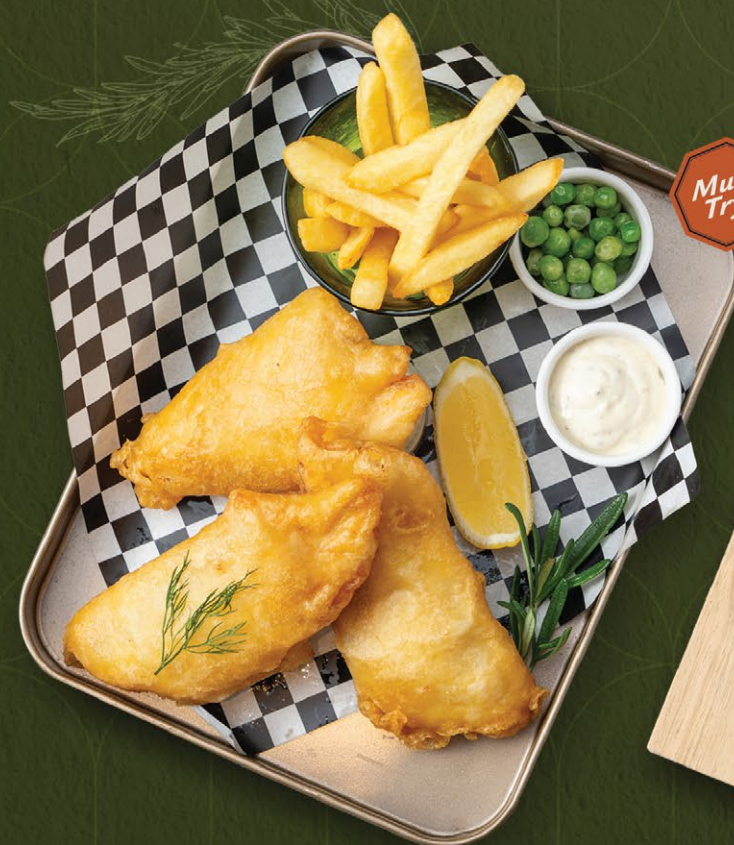
Fish and Chips with French Fries and Tartar Sauce 380