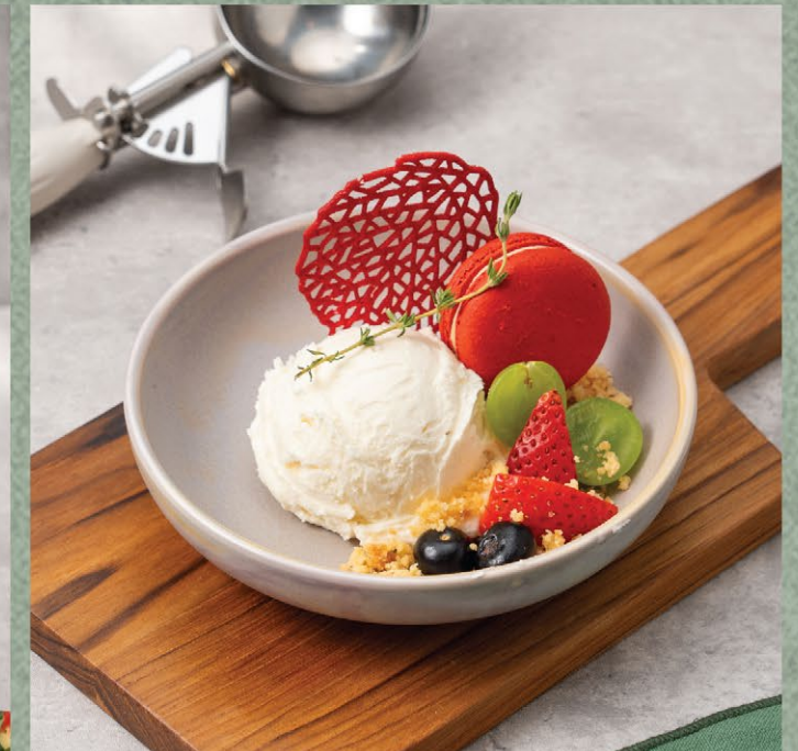
Ice Cream with Mixed Fruits and Macaron 230