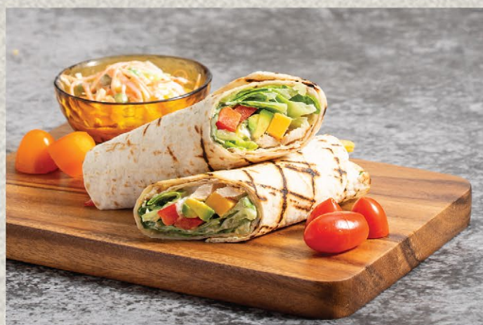
Wrapped Chicken Roll Smoked Chicken, Baby Cos, Cheddar Cheese, Caesar Sauce and Coleslaw 350