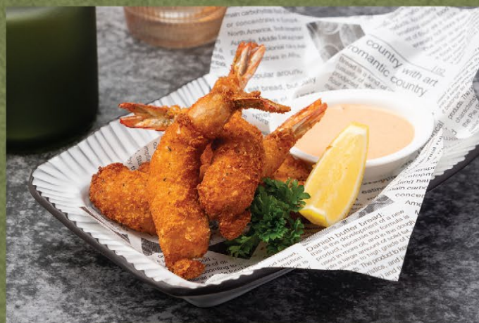
Coconut Shrimp with Sriracha Mayo 320