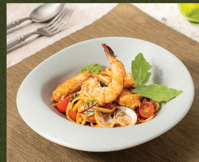
Seafood Linguine 🍷 with Mixed Seafood in Tomato Sauce 420