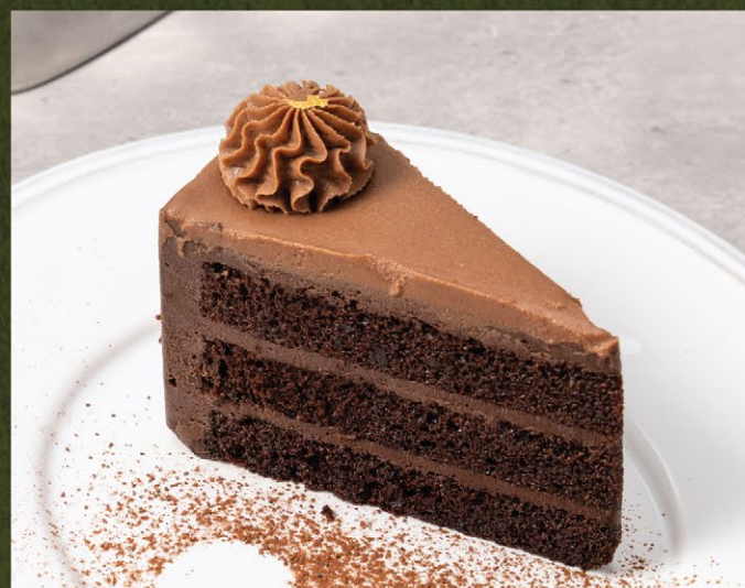
Ultimate Chocolate Cake 240

All prices are subject to 10% service charge and 7% VAT in Thai Baht. The pictures are for advertising purpose.