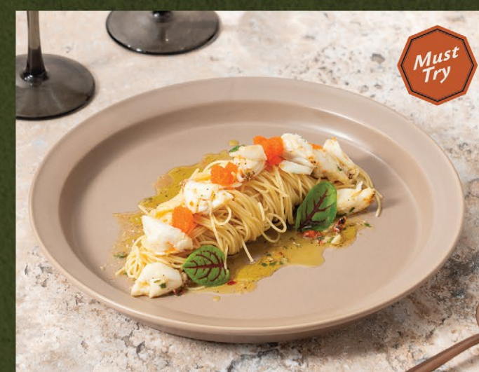
Angel Hair Pasta with Crab AOP Capellini, Cilantro and Chili Flakes 690